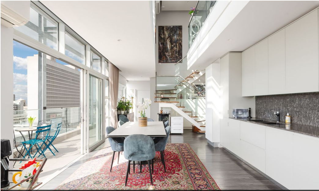
ON SHOW, SOLE MANDATE Web Ref KIR233